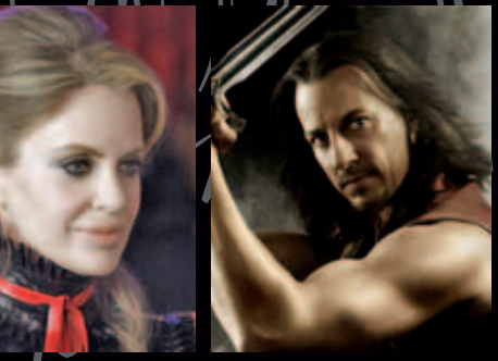
Craig Parker Legend of the Seeker • LotR